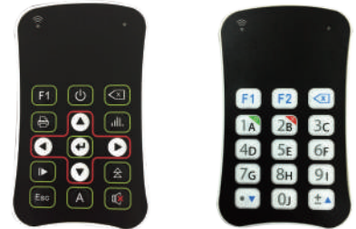
IRF-400T For Teacher